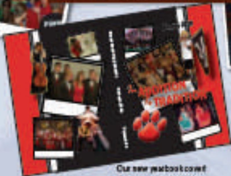
Our new yearbook cover!

We're busy building the biggest story of the year—the RHOREA YEARBOOK—and you're in it! Here's a sample of what's to come.